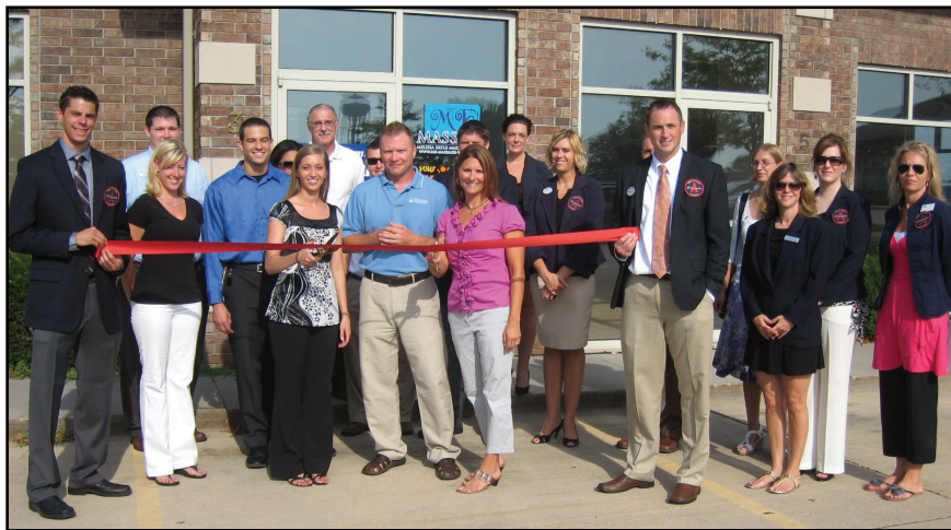
Your Choice Wellness & Bakeris Family Chiropractic ribbon cutting, 2411 Coral Court, Suite 3, Coralville, August 2.