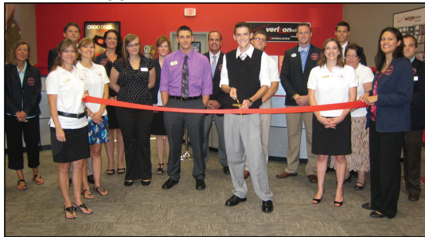
Z Wireless ribbon cutting, 23 Highway 1 West, Iowa City, August 3.